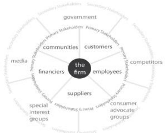
Fig. 1. Stakeholder Theory Diagram (Freeman et al., 2007)

In his book “Strategic Management: A Stakeholder Approach”, Freeman (1984) has been recognized as having launched the stakeholder theory concept, in which he has described stakeholders that have a common interests or rights arising from that common interest, can be classified as form a group. Freeman attempted to describe the relationship between the company and its environment, as well as how the company will behave within that environment. The author depicted his model on a chart, whereby he set the company as the centre, surrounded with the stakeholders which are associated with the company (Figure 1). The conceptualization of this theory was developed so that the organisations are able to identify, assess and analyse their various characteristics, as individuals and as groups and hoe these influences or being influenced by the company (Wagner et al., 2011). The link between this paper and the stakeholder theory is the link between the company and its stakeholders and how the corporate governance practices and corporate social responsibility engagement will impact the various stakeholders of the company.